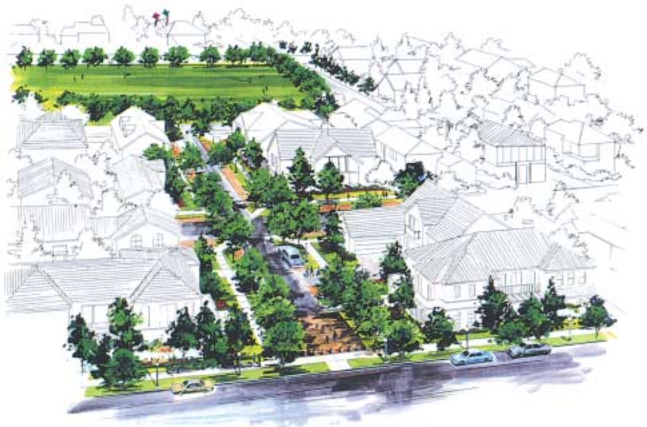
ILLUSTRATIVE STREET SCENE LOOKING TOWARD CENTRAL PARK