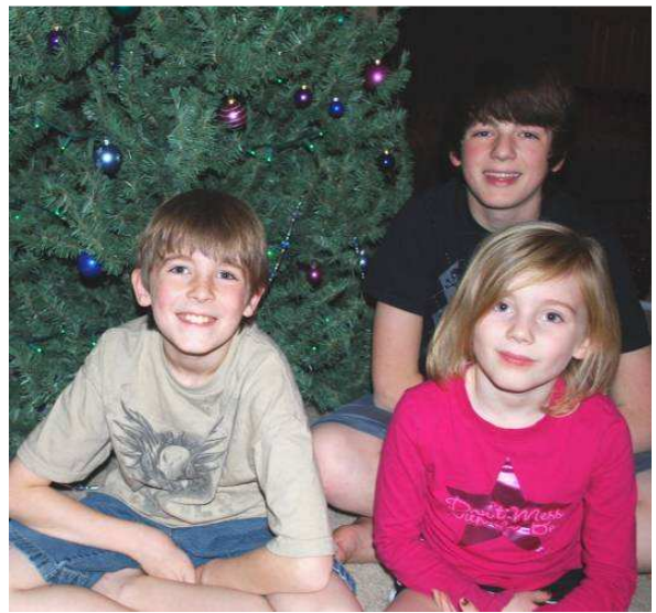
Waiting patiently (?) to open presents