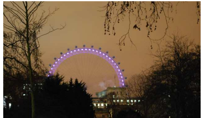
The London Eye at night

I'm a big fan of Coldplay's first three albums, but this one surpasses them all. Buy the deluxe version with the Prospekt's March EP for $2 more. I didn't, and ended up paying $9 to buy it separately.