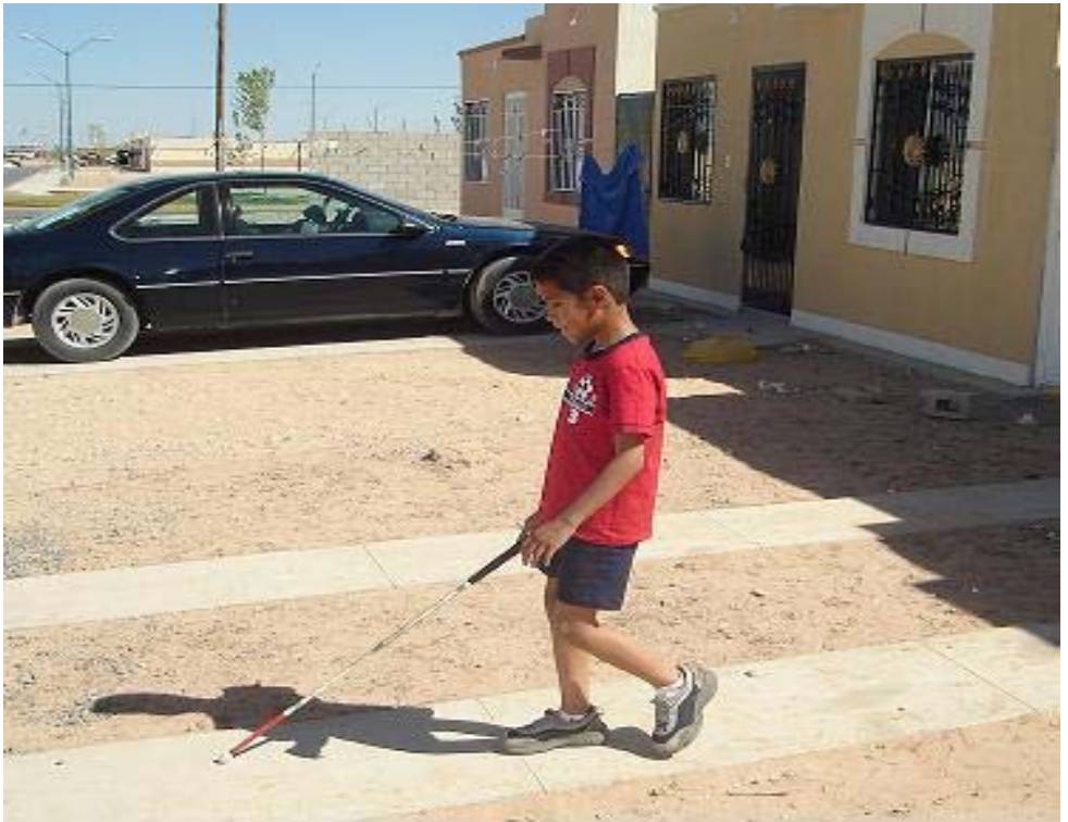
Boy with visual disability practices orientation and mobility skills learned through Vision Juarez, Cd. Juarez, Chihuahua, Mexico (See related story, next page.)