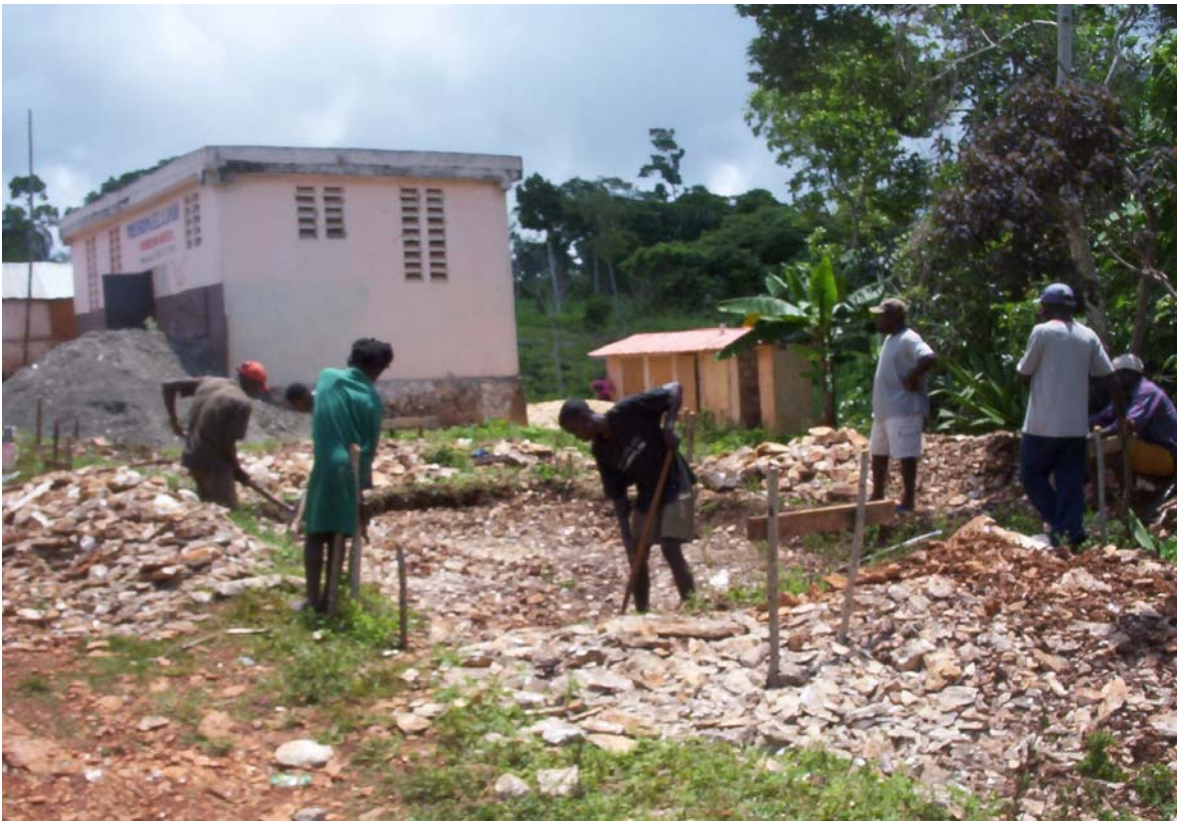
Haitian Volunteers work hard to install water cistern before the rainy season in Jacmel area of Haiti. OFI approved funding for this clean water collection system the 26th of April! The water will be used for the 66 orphaned children studying in the white school house, upper left. (See related stories, Page 1)