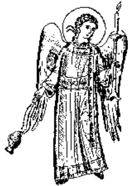
The Feast of St. Michael & All Angels September 29 th