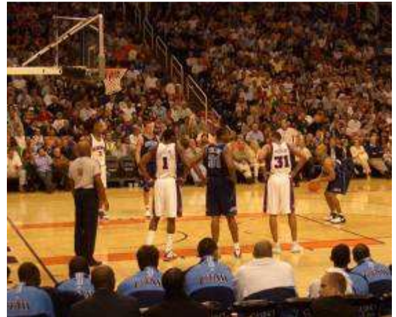
From our seats behind the Jazz bench