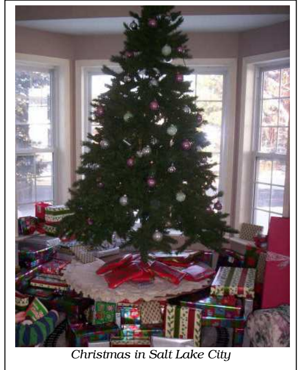
Christmas in Salt Lake City

We spent the days after Christmas visiting with family and friends, and discovered that we were much more popular as returning visitors than when we lived there. Besides family, we met up with work friends, high school friends, and friends from our last ward. We literally ran out of time to see everybody we had planned to see before returning home on New Year's Eve.