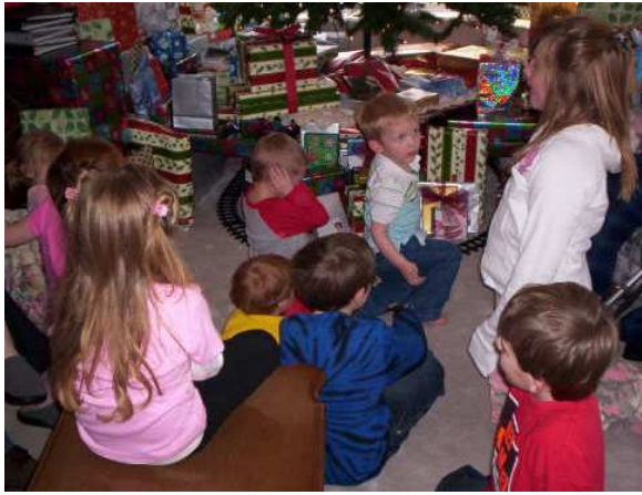
The grandkids wait to open presents.