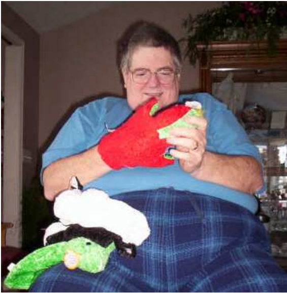
"How did you know I wanted puppets for Christmas?"