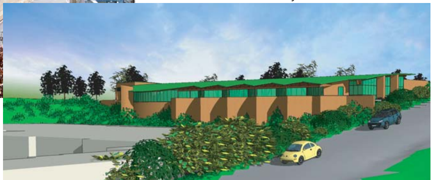
Completed Library - View from Cornish Avenue