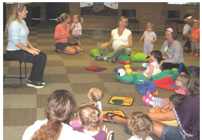
TODDLER READING PROGRAM