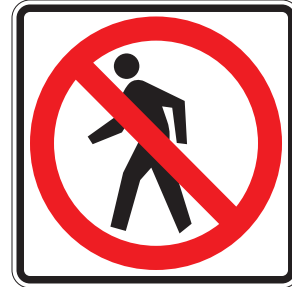
R9-3a 450 x 450 mm (18 x 18 in) min. Black and red on white