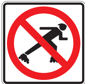
R9-13 450 x 450 mm (18 x 18 in) min. Black and red on white