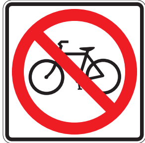
R5-6 450 x 450 mm (18 x 18 in) min. Black and red on white