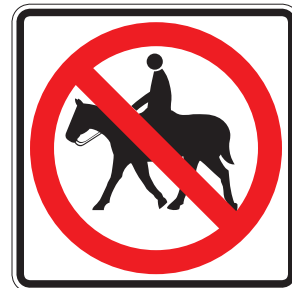
R9-14 450 x 450 mm (18 x 18 in) min. Black and red on white