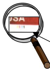
PLATE # BOTTOM