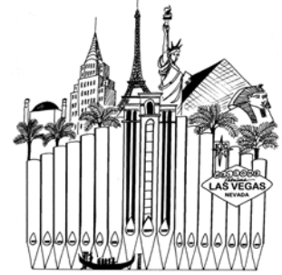
Southern Nevada Chapter American Guild of Organists