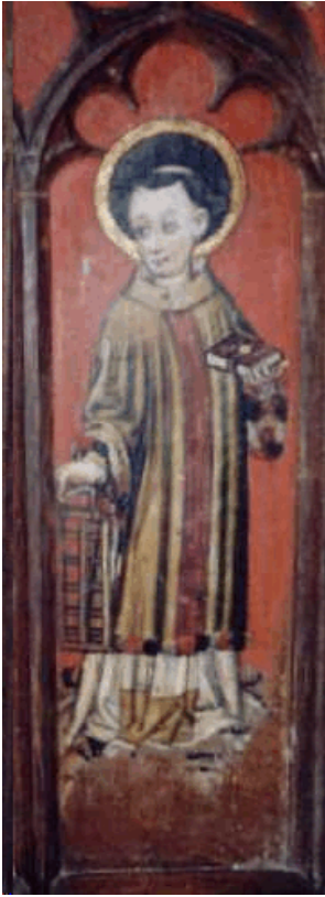
An icon of St. Lawrence from the Rood Screen at St. Mary's Church, Somerleyton, England

suspended between the columns and, when closed during the consecration of the Holy Gifts, emphasized the mystery of the Eucharist. If St. Gregory's has a canopy in the future, it is likely to be a simple cloth suspended over the altar.