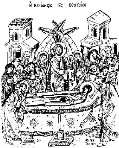
The Feast of the Dormition - August 15

St. Caesarius returned to Arles in 514 and was able to lead his people for 28 more years. When he recognized that he was nearing death, he asked to be carried in a chair to a monastery of nuns which he had founded nearby with his sister as the first abbess. The nuns were engaged in working with wool and embroidery, making and mending clothing for themselves and others in the city. In addition to the hours of prayer, their rule called for two hours of reading from scripture and the Fathers each day, and some of the nuns were also engaged in transcribing and illuminating manuscripts. St. Caesarius had a special affection for these nuns and they for him. He now tried to prepare them for his death and, returning to his cathedral, he ended his earthly life of service among his clergy on the eve of St. Augustine's day, August 27, 542.