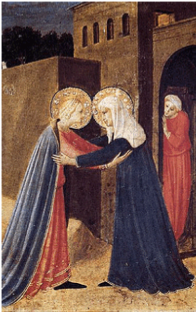
The Feast of the Visitation - July 2

St. Caesarius teaches us another step in developing discipline from this stage of his life. He found that the monks of his monastery had not been accustomed to praying all the office on a daily basis. So he set about establishing the regular routine of singing the office seven times a day and once in the night. Abbot Caesarius encouraged the lay people in the area to join the monks at prayer whenever their work allowed them time, and taught that