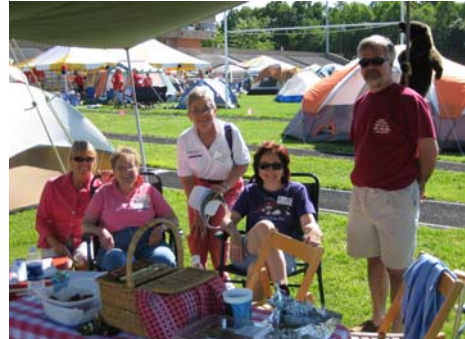
Reston Relay for Life