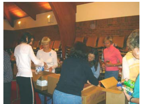
FISH Holiday Baskets