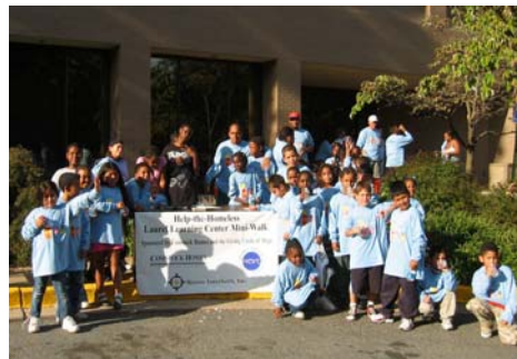
Help the Homeless Mini-Walk