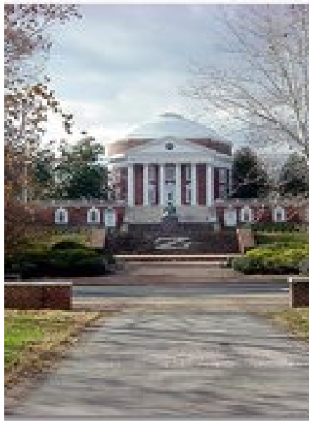
Rotunda at The University of Virginia, Charlottesville.