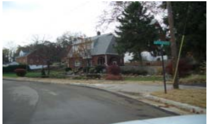
Crosswalk on Main Street (top) and new sidewalk on Valley Avenue (bottom) are visible improvements to our neighborhood.