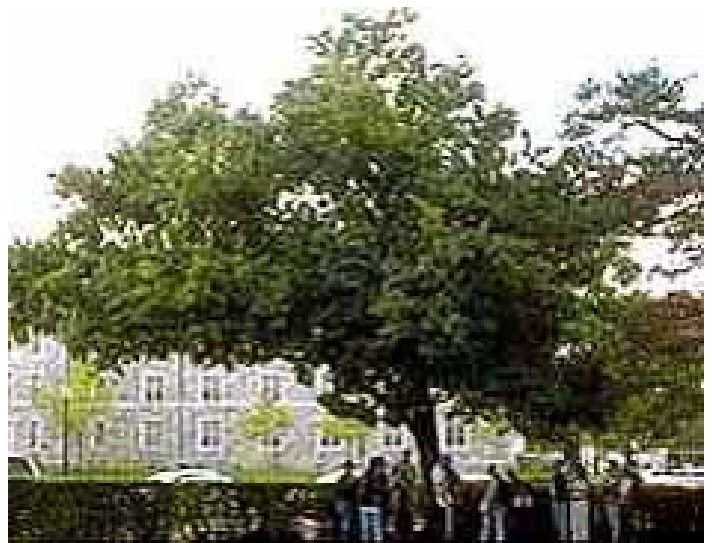
Chinese Elm at maturity on Virginia Tech Campus. Our trees will be more upright.