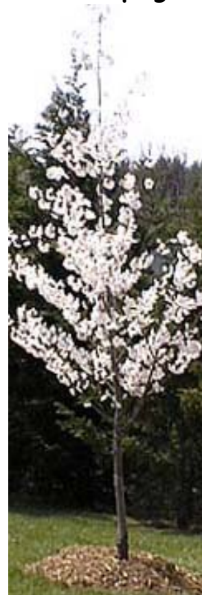
Yoshino Cherry in Bloom