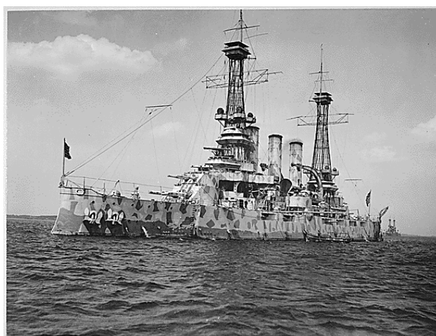
Battleship New Jersey ca. 1918.

September 14 (Tuesday) 8 PM – Regular Meeting, Bethesda Naval Hospital