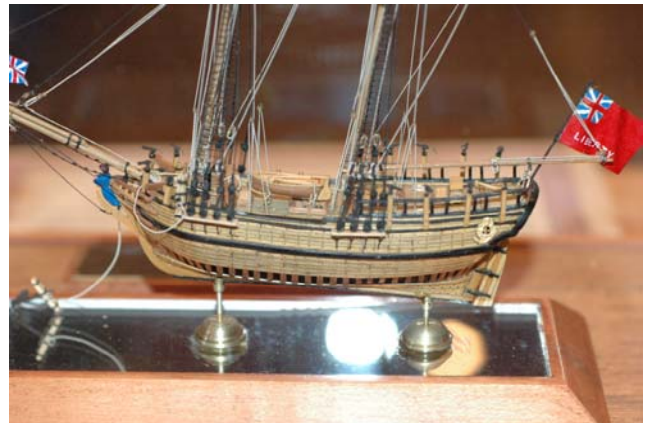
One of Jack Goldstein's 1/16 scale jewels