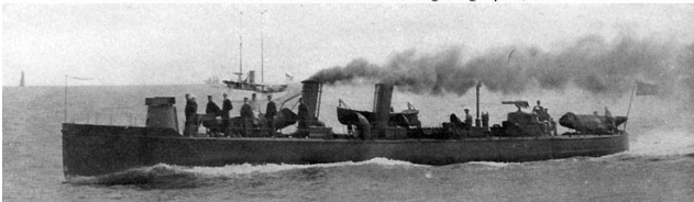
Torpedo Boat USS MacKenzie ca 1899.

Photo # NH 102746 USS MacKenzie steaming at high speed, 1899