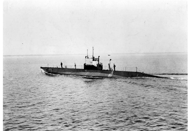
USS L-3 Running trials off Provincetown, Massachusetts, September 1915.

Photo # NH 51126 USS L-3 running trials off Provincetown, Massachusetts