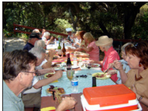
The banquet table members chow down.